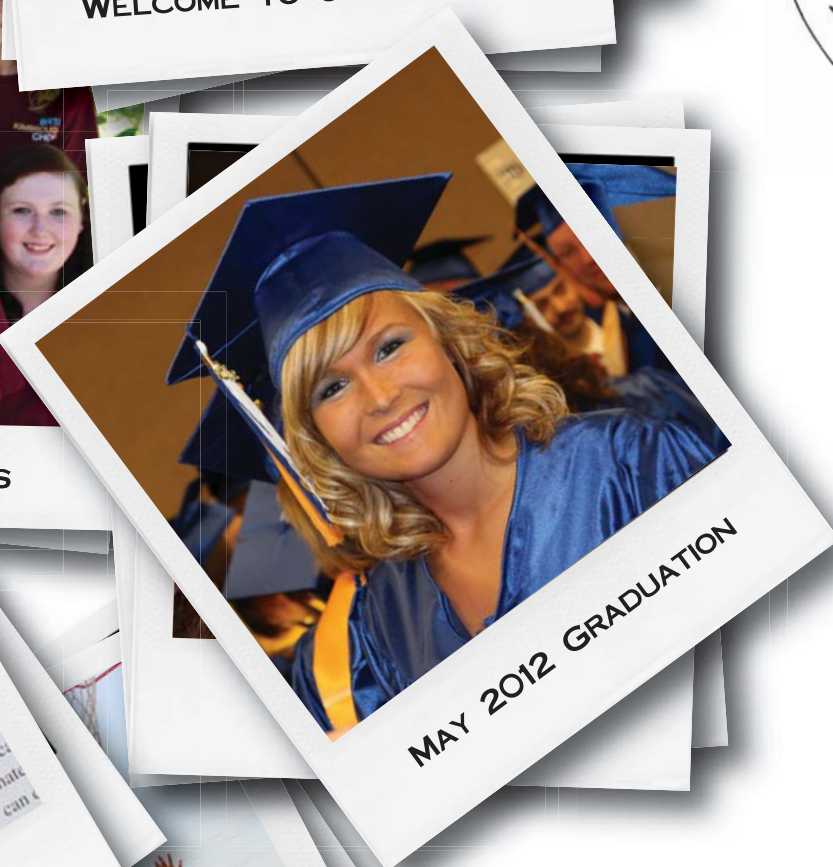
MAY 2012 GRADUATION