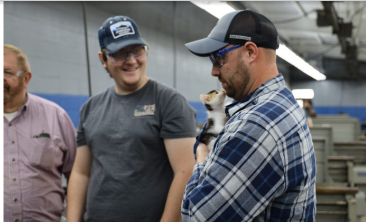
Tuesday, October 26, 2021, Clip from Good Morning Region 8 Read in browser »