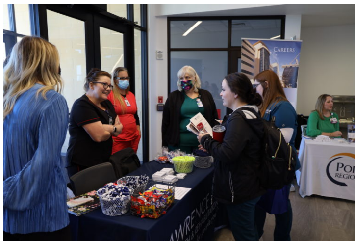
RN Job Fair at BRTC