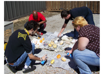
Art students paint pumpkins and rocks for club fundraiser.

The BRTC Art Club recently raised over $700 by selling painted pumpkins, baked goods and other miscellaneous items, according to Fine Arts instructor and Art Club sponsor Dr.