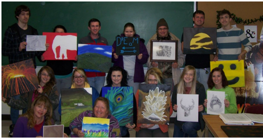
Art students with some of the pieces they donated.

In the midst of finals and the rush of the holiday season many BRTC students gave up their personal time and resources to help others.