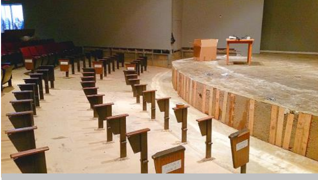
First 3 rows of RCDC auditorium seating after flood

Last year your donations to the BRTC Foundation provided almost $40,000 in scholarships as well as provided financial support for the