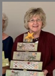
Farmhouse Tree Class

Contact Cally at (870) 248-4182 or visit blackrivertech.org/community/ for more information!