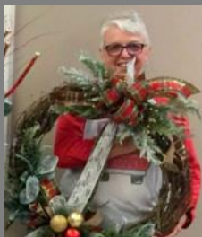
Holiday Wreath Class

Past classes include the following workshops: