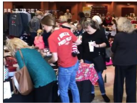
Shoppers at the Holiday Showcase

On Saturday, December 1, BRTC Corporate and Community Education hosted the first annual 'Tis the Season Hometown Holiday Showcase. Located in the Randolph County Development Center, it was a fun day of hometown holiday shopping. Forty-five local vendors and businesses brought in over 500 shoppers!